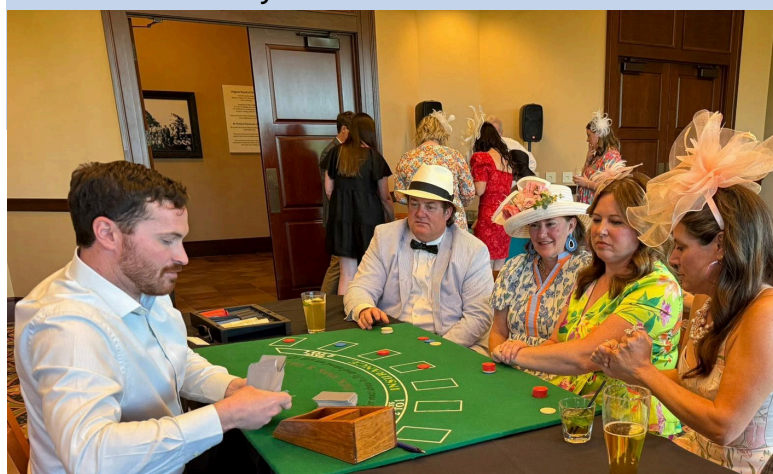
The night was capped off with some casino games.

Next year’s Mint Julep Jubilee Fundraiser will be held May 2nd.