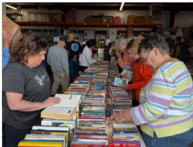
Customers look through their favorite genres at the spring book sale.

The annual Fall Book Sale will be the next chance for customers to stock up on their reading. That event is scheduled for October 17 th and 18 th at Hospice Circle of Love.