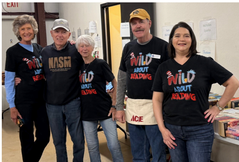
Hospice Volunteers sort books and work each sale.